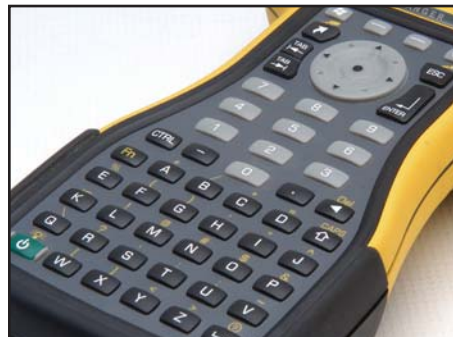
The Ranger features ergonomic navigation, alpha and numeric keypads that are easy to use when wearing gloves.

Integrated Bluetooth Optional Standard Integrated 802.11b Optional Optional