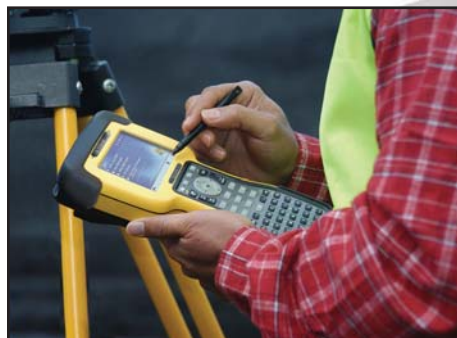
Featuring Windows Mobile, the Ranger runs thousands of familiar applications, and it's easy to transfer data to your PC.