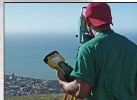
You can use the Ranger's new features and still get 30 hours of battery life under typical conditions.