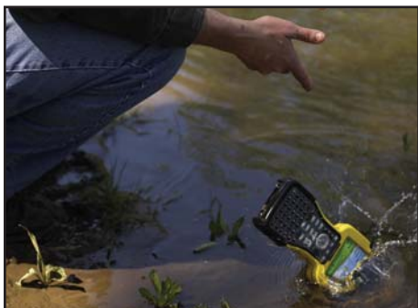
The rugged Ranger shrugs off harsh outdoor environments and rough weather, keeping your data safe.