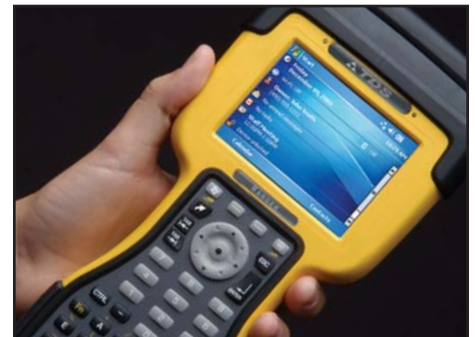
The Ranger's color display remains visible in direct sunlight, with powerful illumination for low-light conditions.